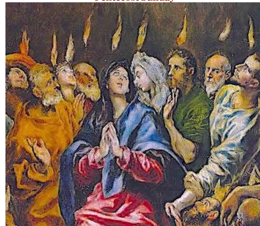
El Greco ~ Pentecost, 1610