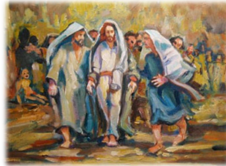
Jesus at Nazareth

July 8, 2018 The Fourteenth Sunday in Ordinary Time