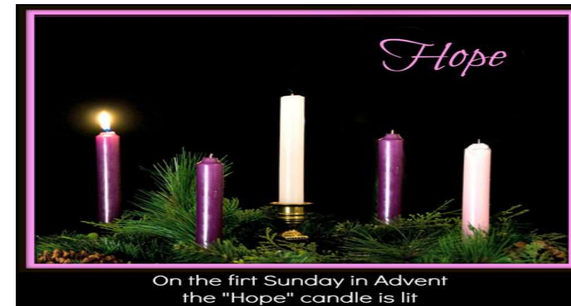
On the first Sunday in Advent the "Hope" candle is lit